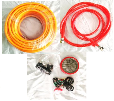
YOSHIDA YS45M POWER SPRAYER