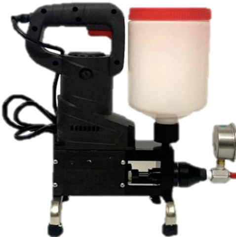
VOMAX 999 GROUNDING MACHINE HAND DRILL TYPE